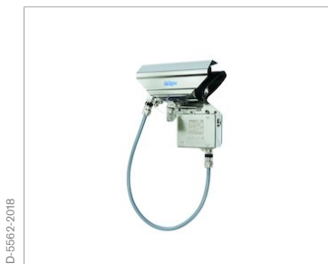
Dräger Pulsar 7000 Heavy Duty