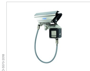
Dräger Pulsar 7000