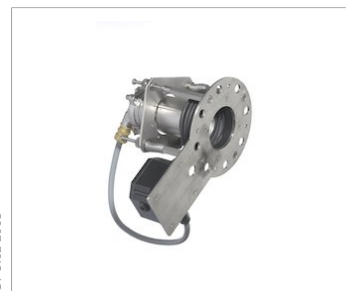
Dräger Pulsar 7000 Duct Mount